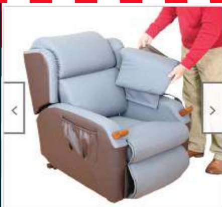
Mouse over image to zoom